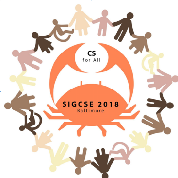
SIGCSE 2018 logo.

More information on these sessions, as well as others at SIGCSE, may be found in the event program at easychair.org/smart-program/SIGCSE2018/ .