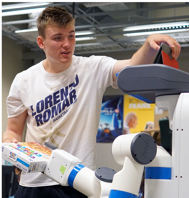
A student programs a robot to help persons with disabilities shop in a store independently.

This is just one of the reasons you may want to teach accessibility. See the AccessComputing website ( www.uw.edu/accesscomputing/ ) for more.