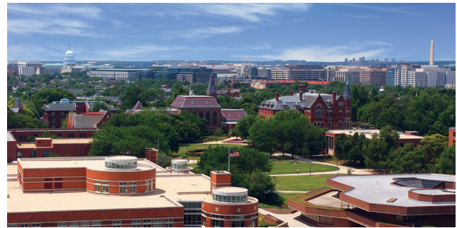
Gallaudet University skyline

The AICT program provides participants with training, experience, and support to create accessible technology to solve concrete problems faced by deaf or low vision users in their regular use of ICT, including television or augmented reality. Participants will get to meet deaf professionals and researchers, and tour institutions involved in accessible ICT