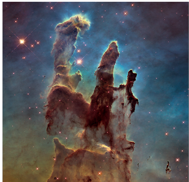
The Eagle Nebula, one of the images you can discover in the astronomy-themed Quorum Hour of Code activity.

Learn more about Quorum and other AccessCSforAll initiatives at www.uw.edu/accesscomputing/accesscsforall .