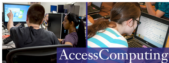
AccessComputing Facebook Banner

AccessComputing and Teach Access are using these results to prepare new materials that provide this missing expertise and these missing links to CS curriculum.