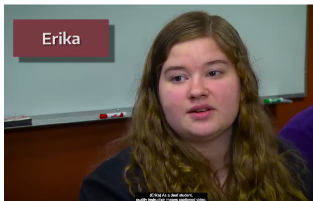
Screenshot from our video, "Quality Education Is Accessible"