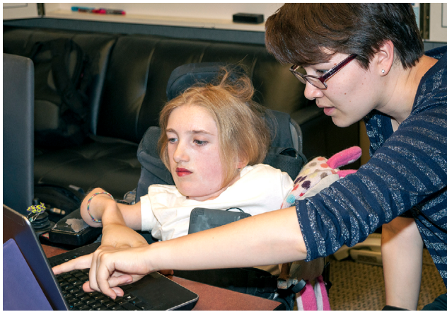
Two students work together on a project at a computing research lab.